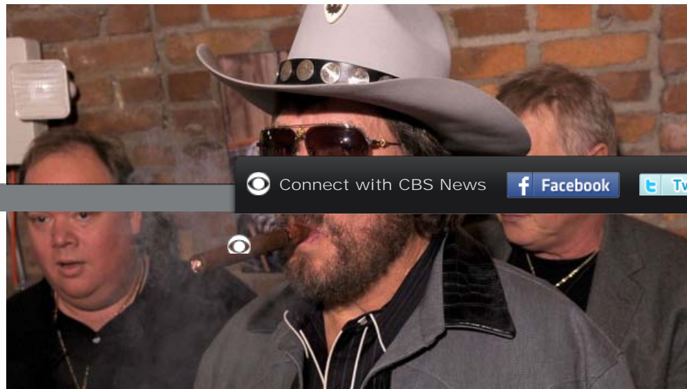
Musician Hank Williams Jr. attends the launch party for Popcorn Sutton's Tennessee White Whiskey at the Marathon Building on November 9, 2010, in Nashville, Tennessee.

When country singer, Hank Williams Jr. , compared President Obama to Hitler , he did his country a