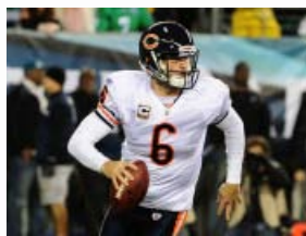
Week in sports: Nov. 4-10